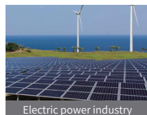
Electric power industry